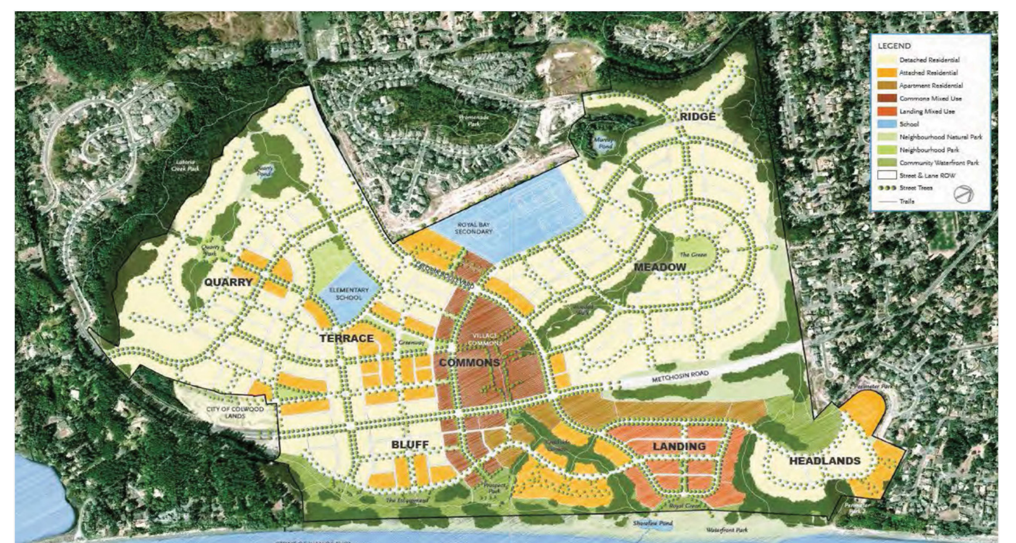
Royal Bay schematic plan (now outdated – for illustrative purposes only)