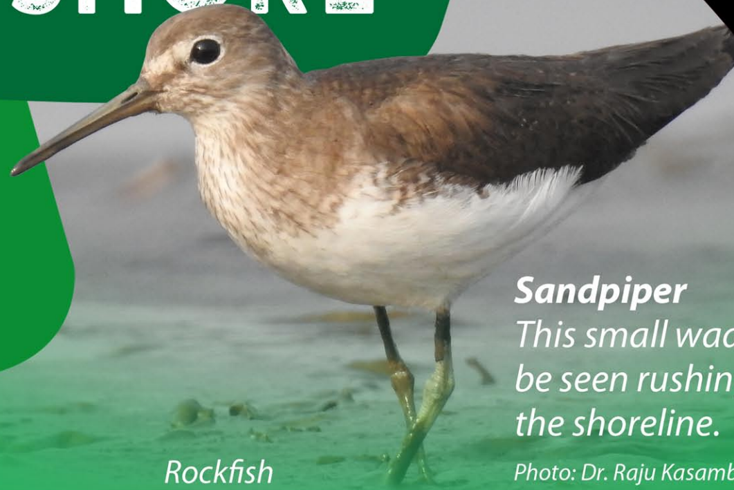
Sandpiper This small wader can be seen rushing along the shoreline.

Twice a day the tide rushes in and out, bringing fresh nutrient laden seawater, providing a rich environment for marine plants like eelgrass and for many species of shellfish.