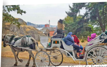
Colwood Seaside Festival