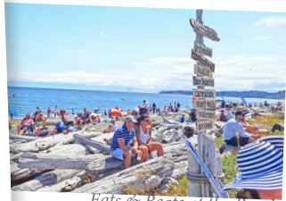
Eats & Beats at the Beach