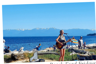
Beach Food Fridays