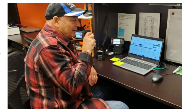
Learn more at www.Colwood.ca/EmergencyPlanning

Building on the successful merger of the Colwood and View Royal Emergency Support Services Teams in 2008, Council recently approved a plan to support and strengthen this service by joining with the View Royal radio operators.